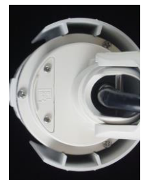
External SD card slot with cover (add rubber for waterproof)