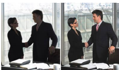
True Wide Dynamic Range

*No SD card slot & local storage function for Argentina