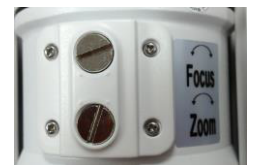
External zoom/Focus adjustment