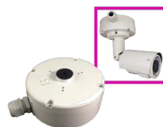
YUK-D06 Junction Box(option)