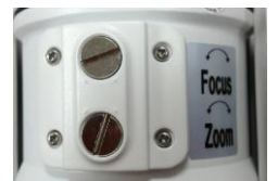
External zoom/Focus adjustment