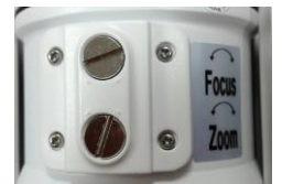
External zoom/Focus adjustment