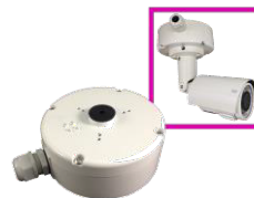
YUK-D06 Junction Box(option)

*No SD card slot & local storage function for Argentina